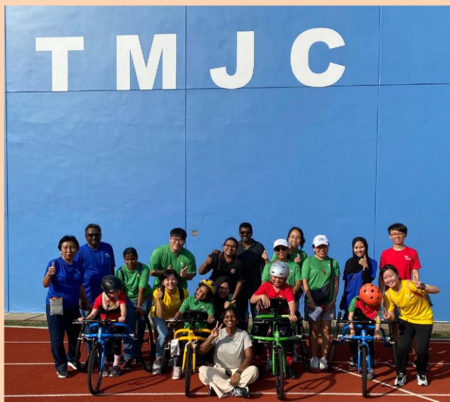
Students and staff at the Sports Day event at Tampines Meridian Junior College.