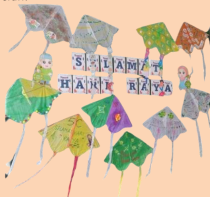
The inter-class Wau (kite) design competition set the tone for the celebration.