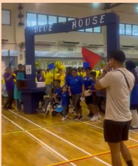
The blue house marching in for their introduction segment

From the moment the starting whistle blew, the air crackled with excitement, as the various houses marched in to showcase their decorations, costumes, and various cheers. Each participant was vying to win the various medals laid out on the trophy table.