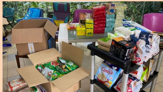
Food items that were contributed by students, parents and staff.

The Hari Raya Aidilfitri celebration on 18 April 2024 (Thursday) exemplified the spirit of compassion and cultural understanding. One of the highlights of the celebration was the launch of Project Bag of Blessing, an initiative that aimed to instil the value of sharing and generosity. The food donation drive for SASCO@Hongsan, a safe home for destitute elderly individuals, received overwhelming support from students, parents, and staff, reflecting the compassionate and caring community within the school.