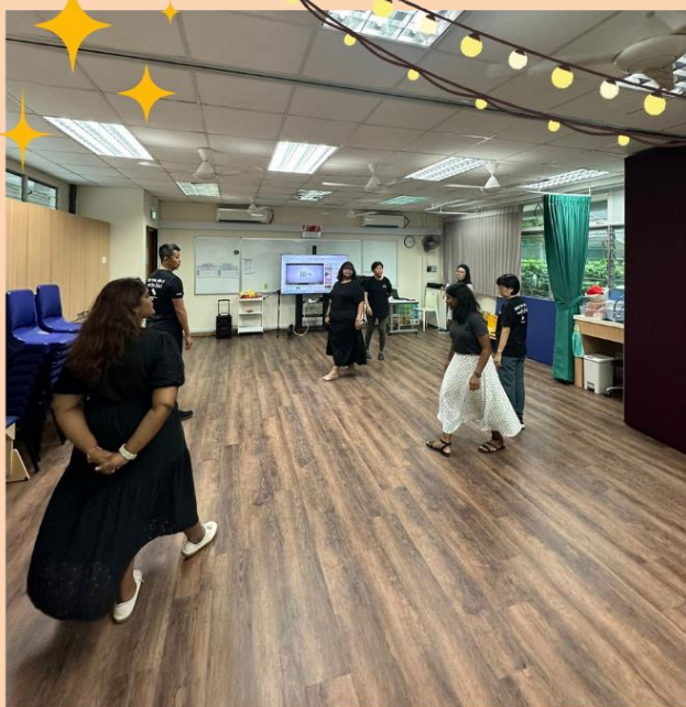
Staff learning the moves and guiding each other as a team