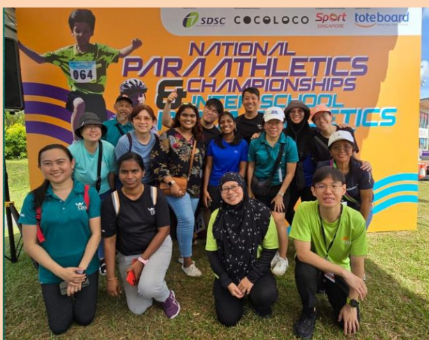
Featuring CPASS West staff and event volunteers

As one of the students' first official event as a frame runner, they showed a lot of grit and enthusiasm to complete their events. Parents were also present to support their children, along with our Allied Health Professionals.