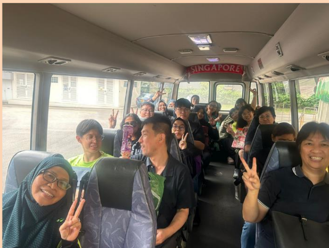
CPASS West staff headed to TMJC

On 27 April 2024 (Saturday), we held our joint Sports Day celebrations at Tampines Meridian Junior College (TMJC) with the entirety of Cerebral Palsy Alliance Singapore (CPAS), including Cerebral Palsy Alliance Singapore School West (CPASS West), Cerebral Palsy Alliance Singapore School East (CPASS East), Early Intervention Programme for Infants and Children (EIPIC), and Adult Services.