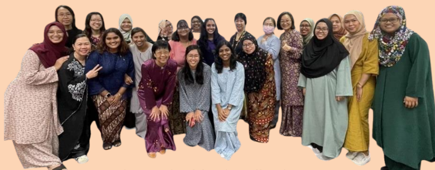
A visual spectacle of female staff and caregivers in burst of colours of traditional Hari Raya attire.

The day culminated in a special treat during snack time, featuring traditional delights such as lontong, sayur lodeh, and chicken rendang, delighting the senses and providing a taste of authentic Hari Raya cuisine.