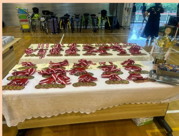
The medal table all prepped and ready for the races

On the day before, all teachers and teacher aides headed from CPASS West to TMJC to help decorate the hall at TMJC.